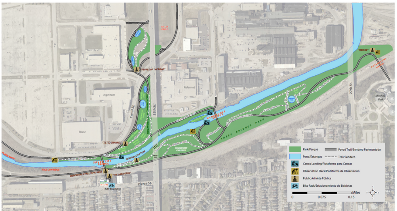
Urban Ecology Center Menomonee Valley Trails / Senderos de Menomonee Valley

Please refer to this map to locate the community garden plots. If you still need assistance, a Neighborhood Engagement staff member is happy to help out!