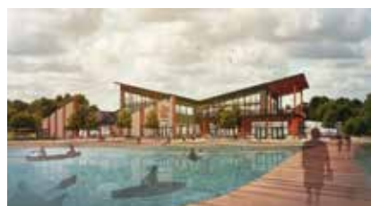
Rendering for the new Urban Ecology Center building in Washington Park

We have aspirations to do big things in Washington Park and yes, if approved, our plans could save taxpayers upward of $1.8 million while expanding our award-winning programming. This vision could potentially grow our service base of schools within the neighborhood from 18 to 33 urban schools, expand our adult and community programs, expand our native restoration area from 8 to 20 acres and become a community icon for the neighborhood for generations to come. It's exciting! And since it's been in the news, we thought that you, too, should be fully informed. So, here's a little on how this project fits into our larger vision for the future.