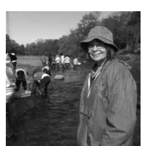
Participants of all ages!