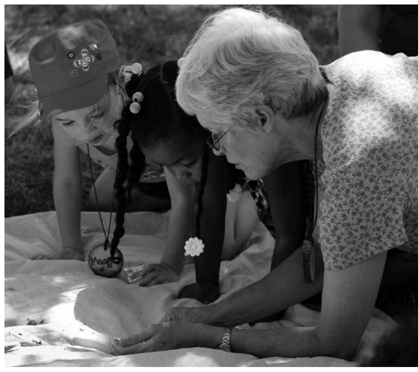
MENTORING AT THE CENTER