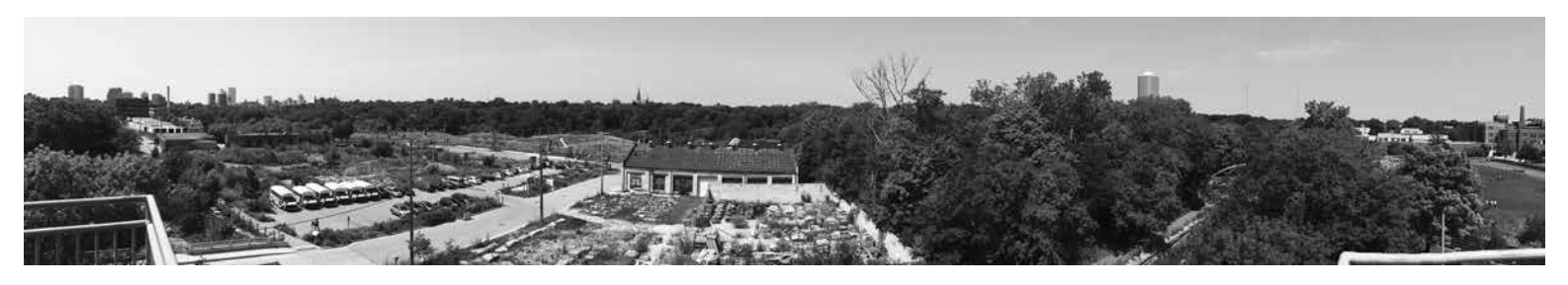
A panorama of the Riverland property

Later in the fall we must dismantle the lower western building. This building has been determined by engineers, developers and the City to be structurally unsound, too dangerous to leave up and too expensive to restore. However, we plan to save the upper, eastern building and in time, renovate it.